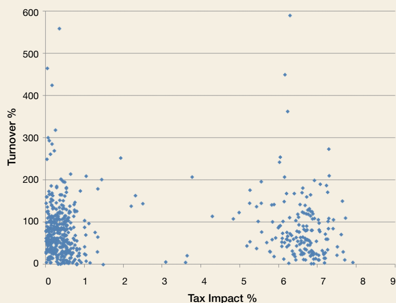
FIGURE 2: TURNOVER IS NOT A GOOD PREDICTOR OF TAX EFFICIENCY, 12 MONTHS ENDING JUNE 30, 2010 (550 ACTIVE FUNDS)

Source: Parametric, based on Morningstar data